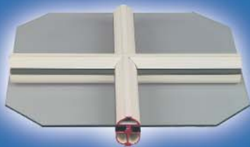
Individual glazing system