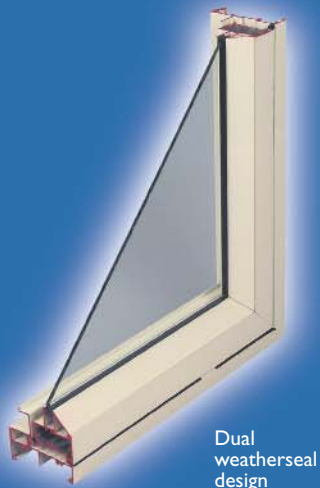
Dual weatherseal design

Certified to ISO9001. Audited bi-yearly to ensure compliance.