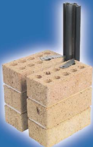
Twist-in frame fixing ties